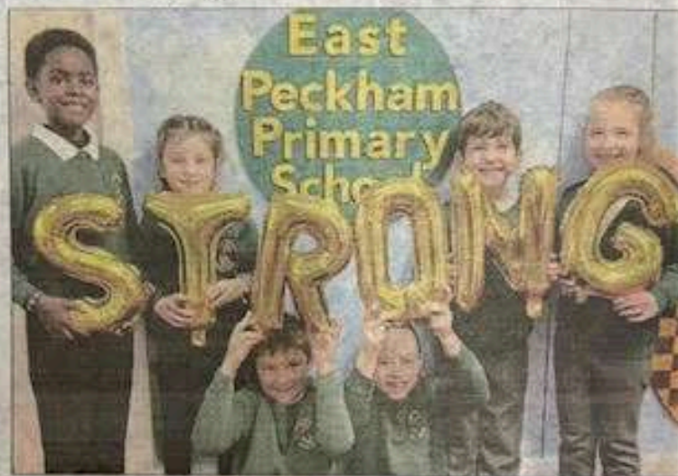
East Peckham Primary School pupils celebrating the report

The school received a "strong standard" in the attendance and behaviour and inclusion categories, and an "expected standard" in the achievement,