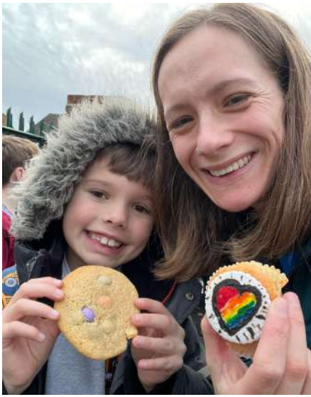
At the kindness bake sale, buying Mum a cake using their own money (and giving Mum a hug too!).