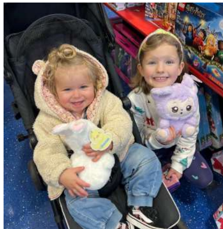
At Smyths toy shop, buying their little sister a toy out of their own money. Little sister was very happy!