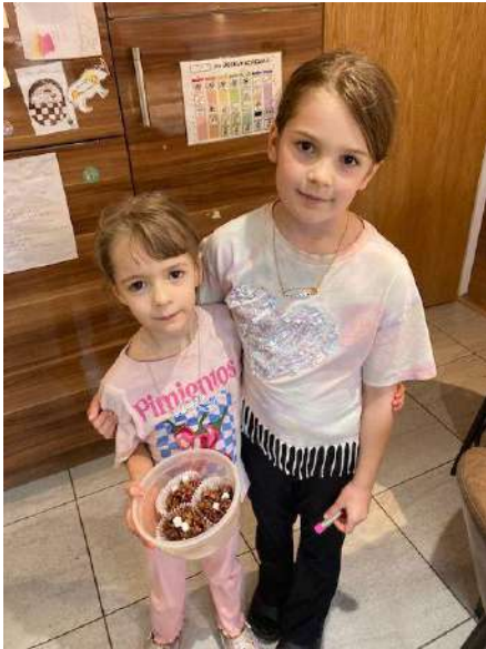
Making rice crispie cakes and handing them out to their neighbours.