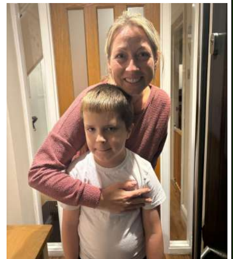
Helping their childminder at snack time with the little ones after school.