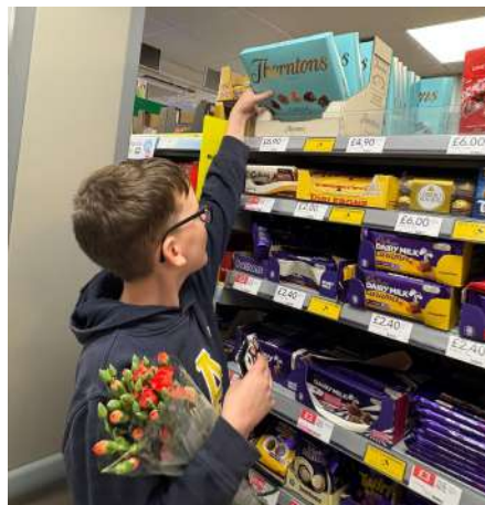
Buying chocolates and flowers to surprise their auntie.