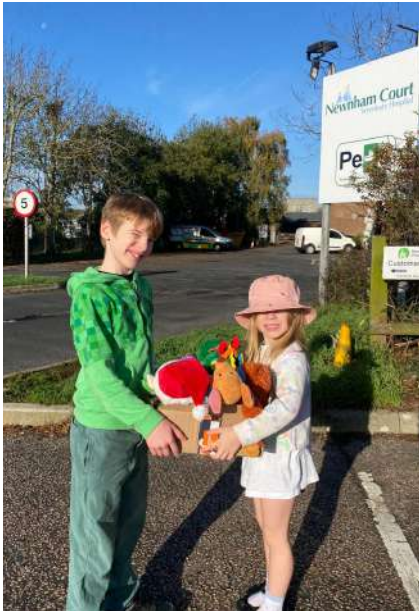
Donating a selection of their toys to the vet hospital so the animals would have something nice to cuddle.