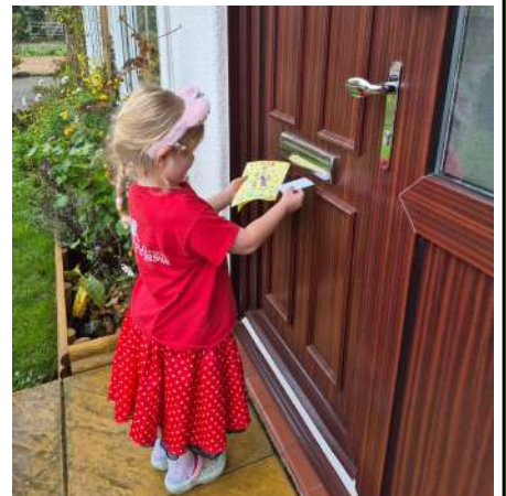
Making a card for their neighbours.