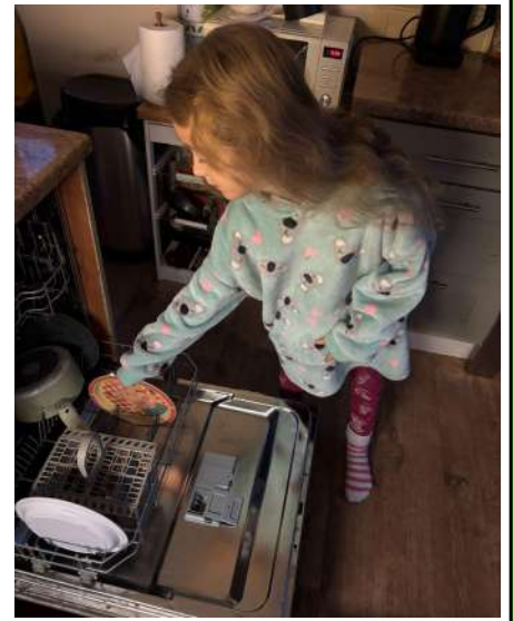
Helping out at home by loading the dishwasher.