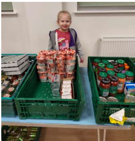
Volunteering at the 'Community Fridge' - a community initiative to help fight food waste, helping to hand the food out to people who came.