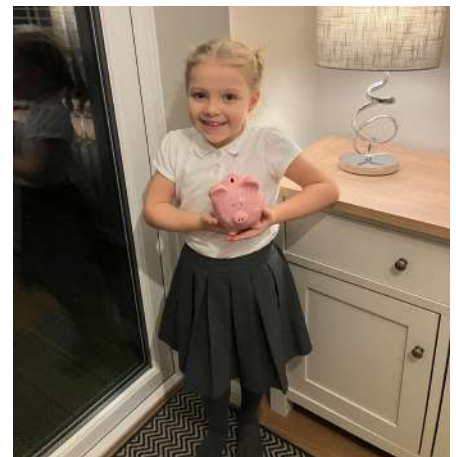
Using their own pocket money to donate to Children in Need.