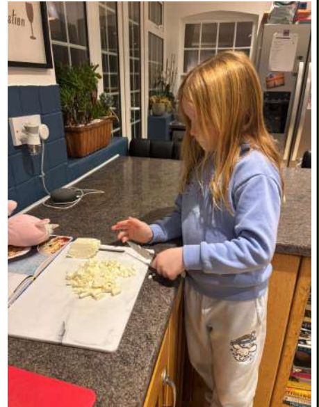
Going out of their way to help Mum (who has an elbow injury) with as many things as possible, including cooking and looking after the garden - really going above and beyond and even helping in the evenings, despite feeling tired!