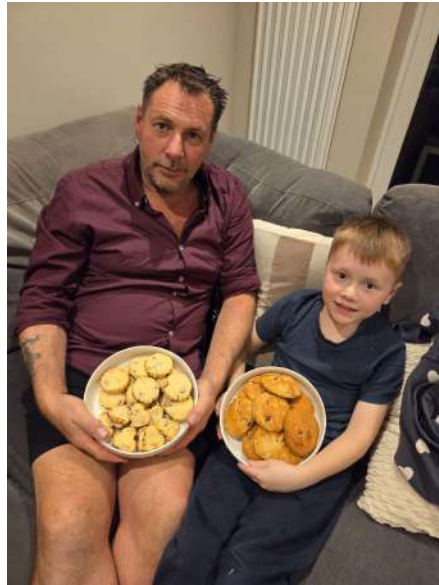
Baking cookies to cheer their Grandad up.