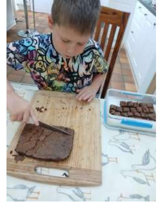
Spending their Sunday baking chocolate brownies and banana bread for all their classmates to enjoy on Monday!