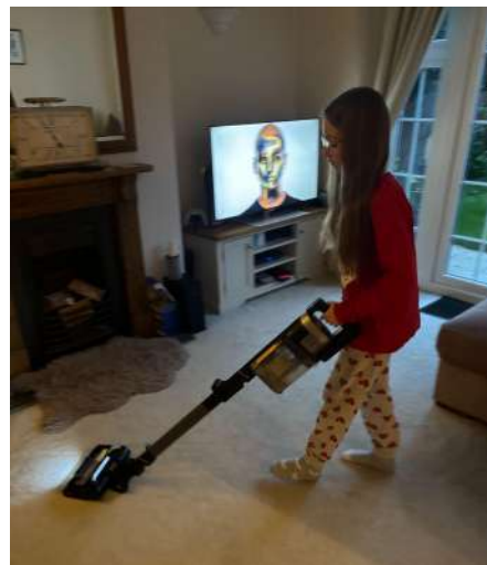
Helping out at home by doing the hoovering.