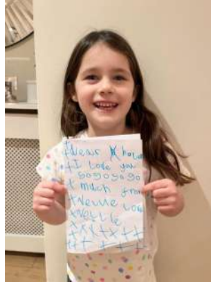
Writing lots of lovely notes for their family and friends! Mum said "the note she wrote for me even made me cry — I did explain they were happy tears!"