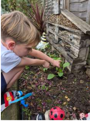
Planting some bee friendly flowers in their garden.