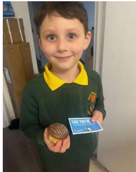
Shared the cake they bought from the kindness bake sale with Mum.