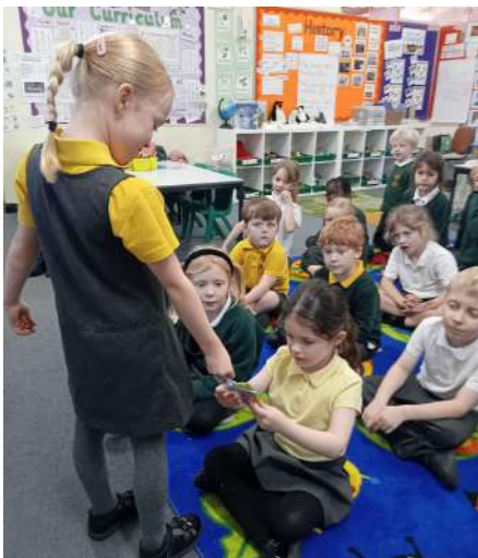
Handed out birthday treats to their classmates.